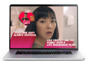
Click here to watch the video.

In connecting with customers, Income's advertising is bold and thought–provoking. It often leverages current social issues affecting Singaporeans such as the protection gap in Singapore and dilemmas faced by the 'Sandwich Generation' to drive conversations and shed light on the importance of financial planning and insurance protection in Singapore, leveraging particularly social media. Examples of its recent awareness and public education campaigns include the "True Care" and "Best Gift for Your Child" campaigns.