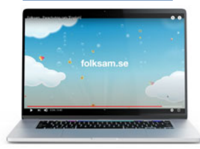
Click here to watch the video.