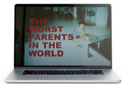
Click here to watch the video.